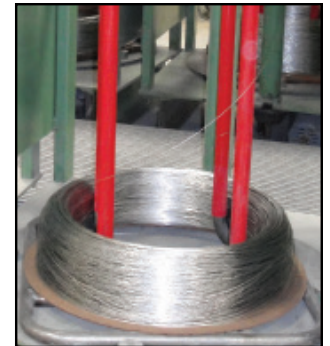
Wire is available in loose coil form in standard diameters. Please contact the Sales Department for non-standard requests.

All trademarks are owned by Haynes International, Inc.