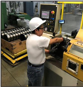
The GIMAX Precision Winder produces high-quality layer wound welding spools.