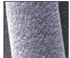
Typical welding wire