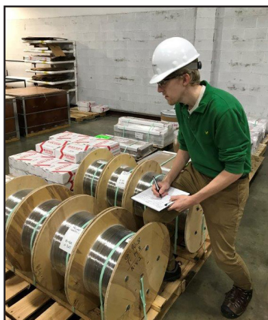
All products are alloy verified prior to shipment.