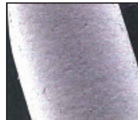
Haynes Wire Products RTW™ welding wire