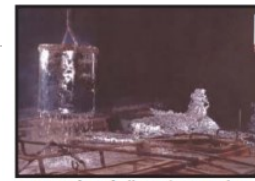
HAYNES ® 556 ® alloy Spinner Basket (weight of original baskets cut in half)

Molten zinc is one of industry's most aggressive high-temperature environments. In hot-dip galvanizing processes, chains, hooks, baskets, racks, trays, T/C protection tubes, and all sorts of other immersed components can simply dissolve away before your eyes! But you can minimize dissolution and bath contamination problems with HAYNES ® 556 ® alloy. The 556 ® alloy combines resistance to molten zinc with excellent high-temperature strength, so you can design your components to weigh less and last longer