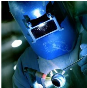
GTAW wire is precision cut and alloy verified prior to shipment