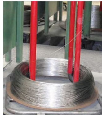
Wire is available in loose coil form in standard diameters. Please contact the Sales Department for non-standard requests.