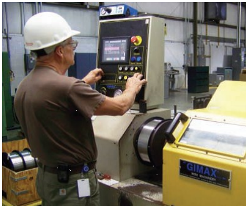
The GIMAX Precision Winder produces high-quality layer wound welding spools.