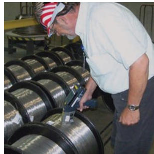
Rigorous positive material identifications are built into every product.